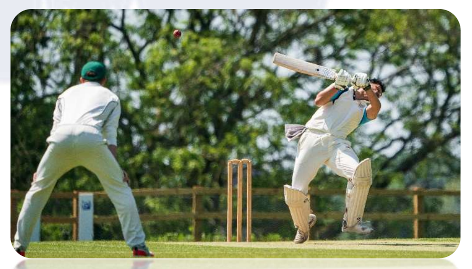
Helmet? Not at your pace mate ... Oops